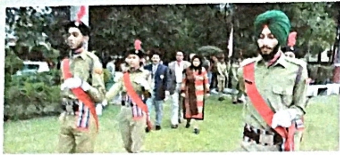
The President flanked by the Mgt. & The Principal to function site of Republic Day.