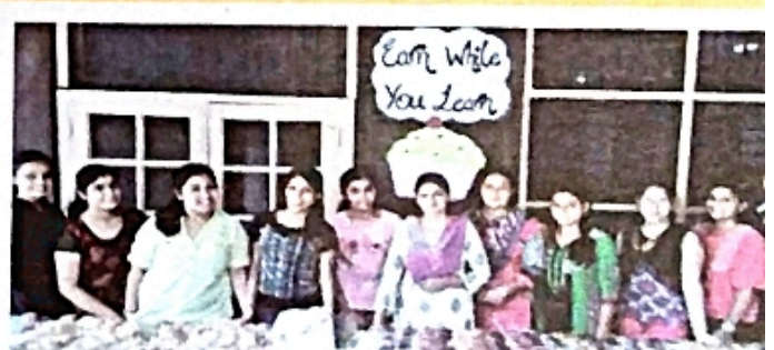
Bakery Stall by College Students under the 'Earn while you Learn' Initiative.