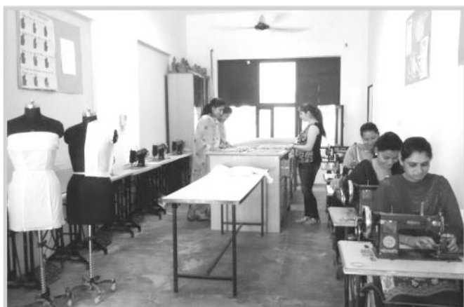
Fashion Designing Lab