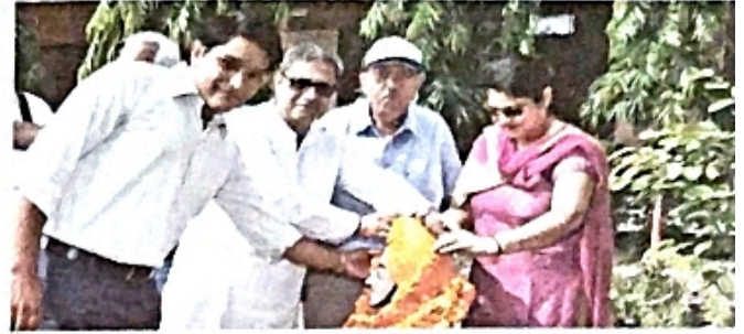
The Management giving floral tribute to Shaheed Bhagat Singh on Independence Day.