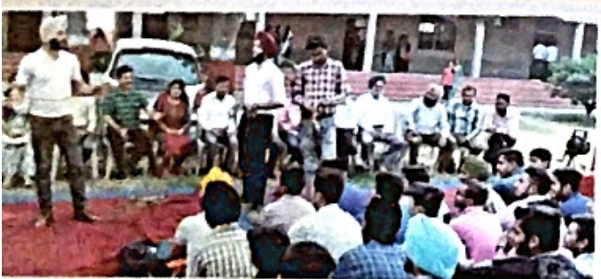
A Glimpse of Civil Defence Camp in College.