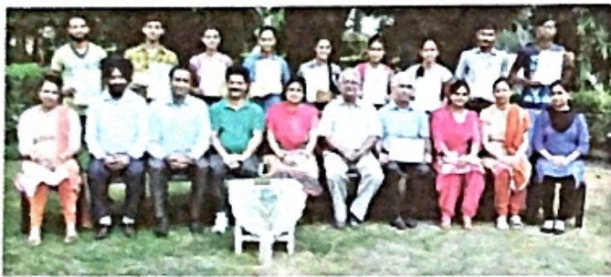
Runner ups of 'Digital India Competition' organised by Ministry of Electronics and Information Technology at P.U. Chd.