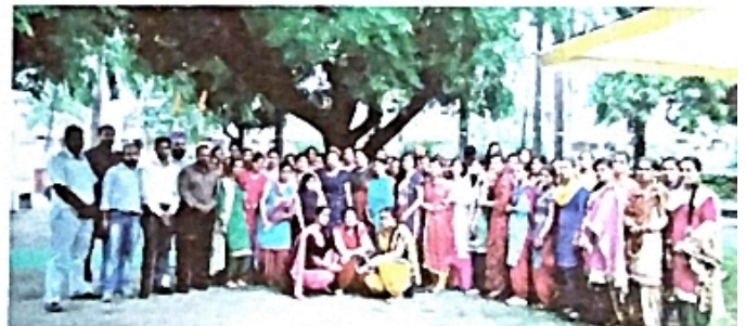
College Celebrating Teej Festival.