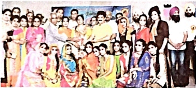
Our Gidda Team receiving 2nd Prize in Zonal Youth Festival.